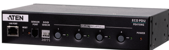
PE4104G Front View