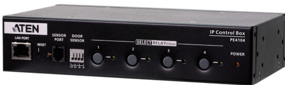
PE4104A Front View