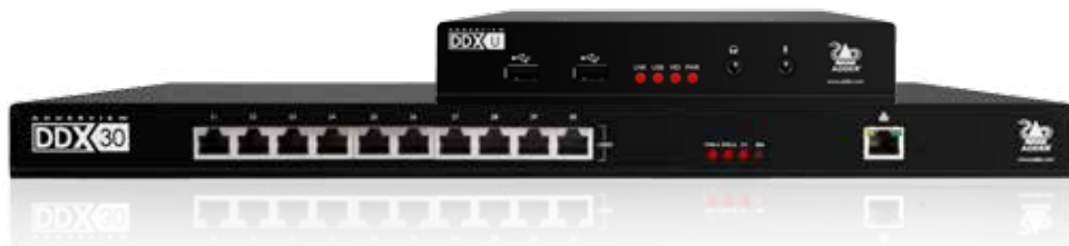
Pictured above: AdderView DDX30. Central KVM matrix switch AdderView DDX USR. User module (receiver)

For each additional break/patch connection reduce distance by 5 meters. Preferably patch cables should be of type CAT6 and less than 2 meters. Patch cables over 2 meters must be CAT6.