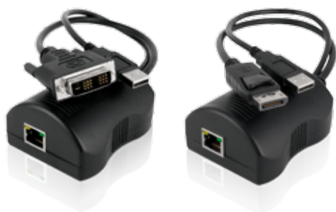
Pictured above: DDX-CAM-DVI (DVI Computer Access Module) DDX-CAM-DP (DP Computer Access Module)

System administrators can securely access the DDX30 management tools to configure system settings, set access privileges and control video connections. The interface is secured using HTTPS & administrators must login each time they connect. An API enables switch control from a 3rd party control system.