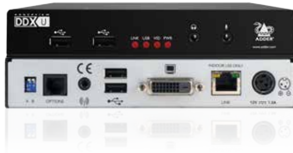
Pictured above: AdderView DDX USR. User module (receiver)