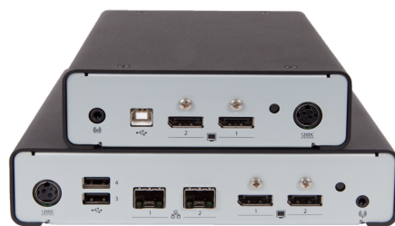
ADDERLink INFINITY 2122 TX & RX - Rear